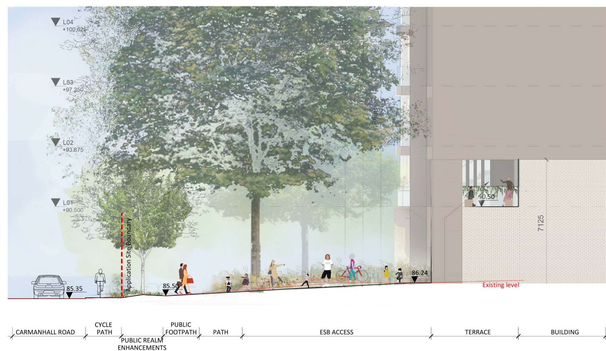
03 Section 03 Section Scale 1:100